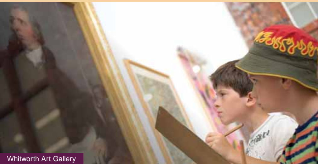
Whitworth Art Gallery

This is an engaging, experiential session that explores portraits and textiles to develop a range of characters. Using drama techniques, such as role-play and hot-seating, pupils explore emotions, motivations and relationships between characters, which can be further developed back at school.