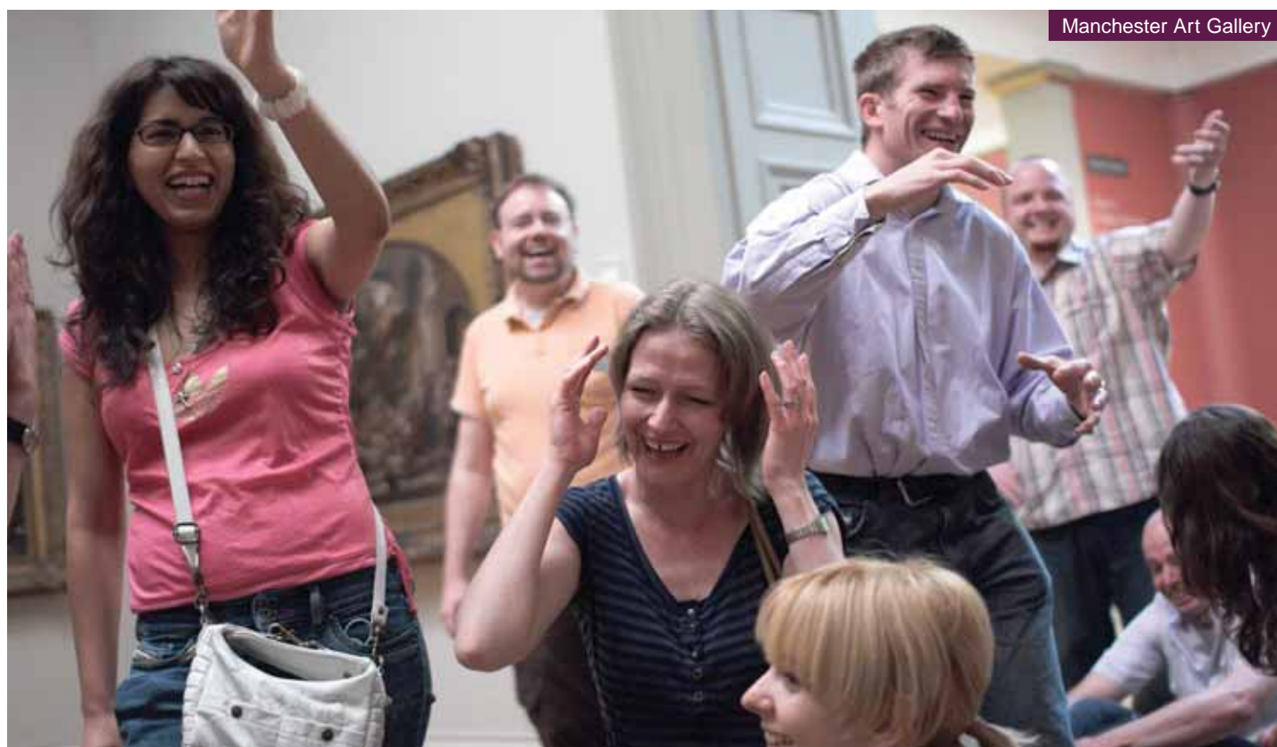
Manchester Art Gallery

For current teacher training and development opportunities at museums see www.mewan.net or contact your local museum or gallery.