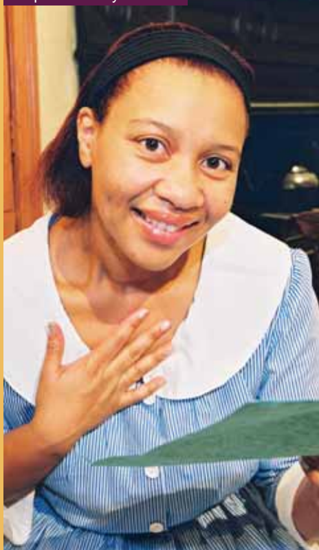
People's History Museum

The Museums and Galleries Initiative in Manchester is coordinated by the Primary Consultant: Museums and Galleries who is part of the advisory team at Manchester Children's Services. It is funded by five museums and galleries in Manchester through Renaissance in the Regions.