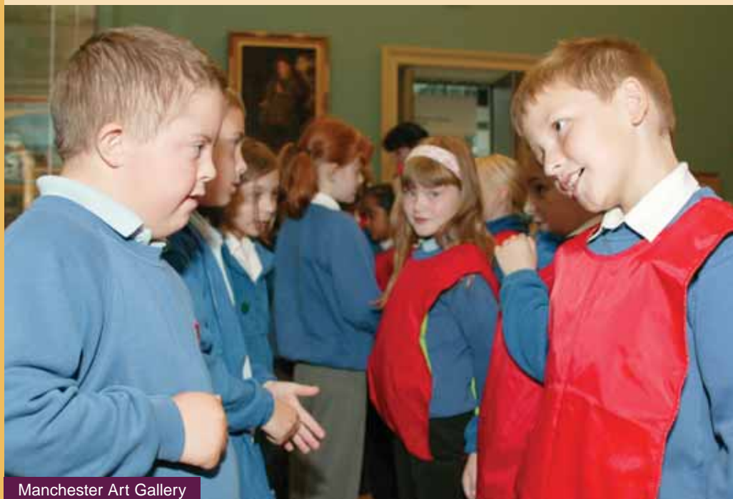
Manchester Art Gallery

This Manchester Art Gallery session is led by writers who take pupils on a fascinating journey into their imagination. Pupils investigate what makes a good story through the gallery's collections exploring characters, plots and vocabulary.