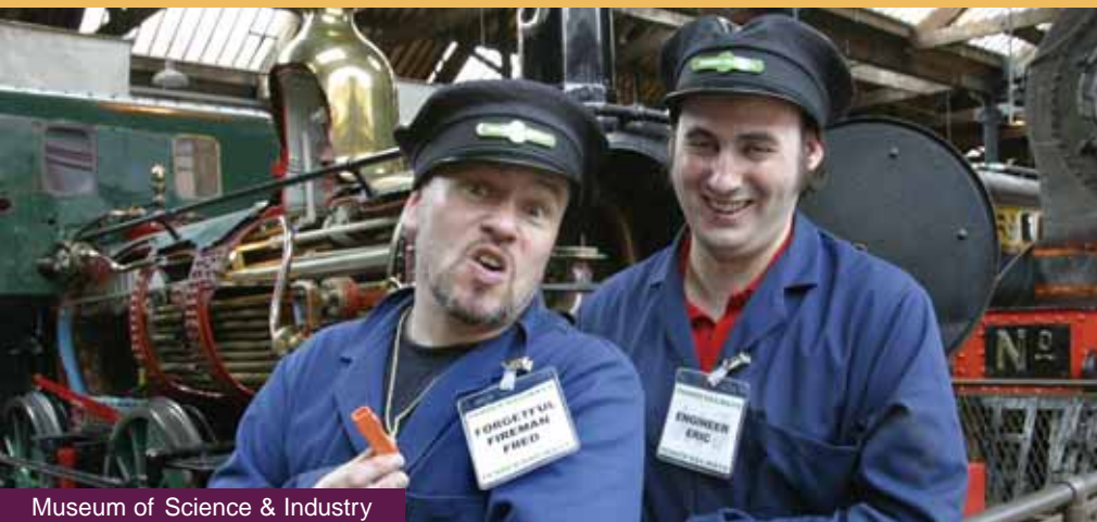
Museum of Science & Industry

This interactive session in the Museum of Science and Industry's Power Hall provides an inspiring experience for pupils which emphasises the vocabulary relevant to the steam locomotive.