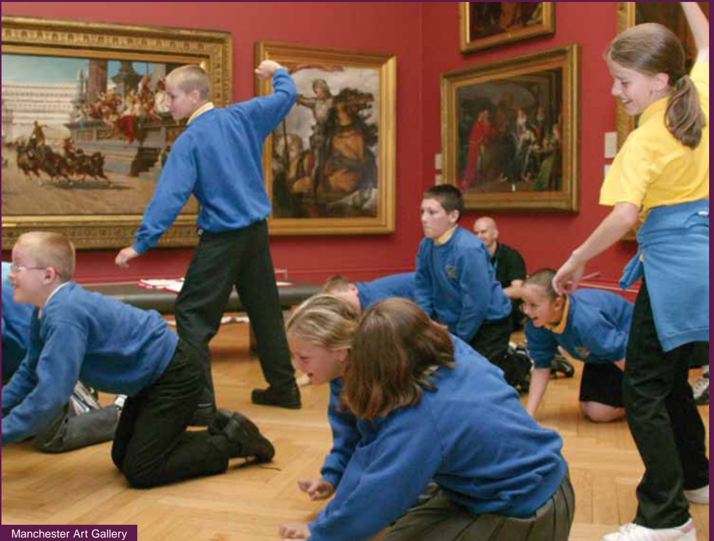
Manchester Art Gallery