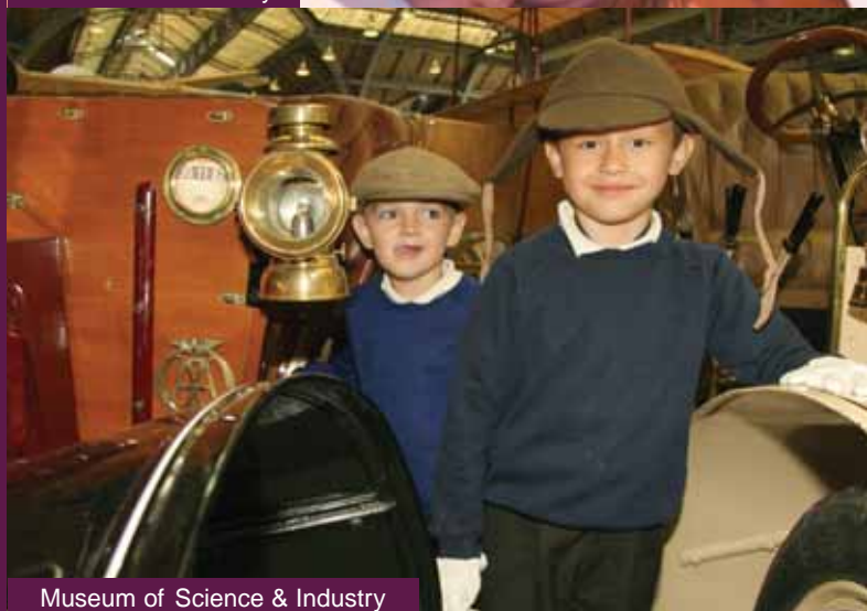
Museum of Science & Industry

RENAISSANCE NORTH WEST museums for changing lives