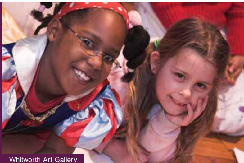
Whitworth Art Gallery